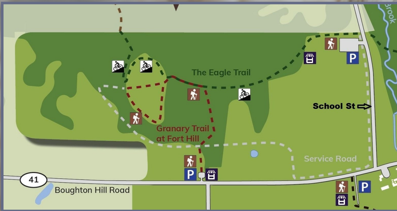
Granary Trail Signs at Fort Hill